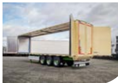
Doors on both sides