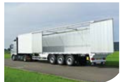
Self-supporting construction with side door opening of 6.8m