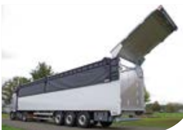
Hydraulic tail gate & hydraulic roof