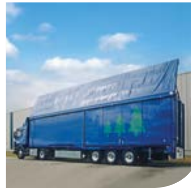
Experience since 1984