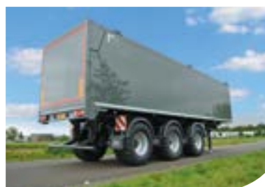
Custom-built agricultural solutions