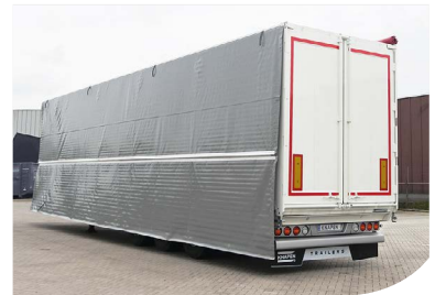
Side wall protection sheet