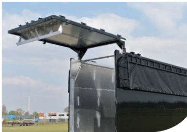
Hydraulic tailgate (integrated doors optional)