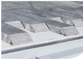
10 mm aluminium

Since 1984, we have focussed on continually improving a single product: the moving floor trailer. This type of trailer has proven to be an ideal and versatile form of transport in many sectors, including waste transport. We call our latest generation NEXT . This generation of trailers is full robot-welded, has been intensively trialled and is based on more than 34 years of experience. This allows us to guarantee our customers years of problem-free operation, the lowest total operational costs and the highest residual value. By pushing the boundaries, we have created an advantage in our branch for more than 34 years. We are proud of this and our customers can hold us to account about it.