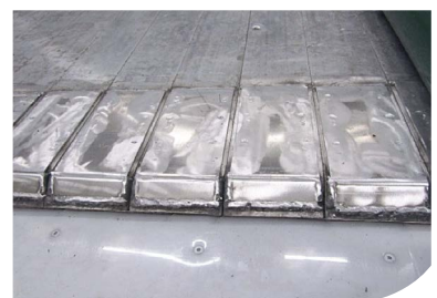
Aluminium protective plates