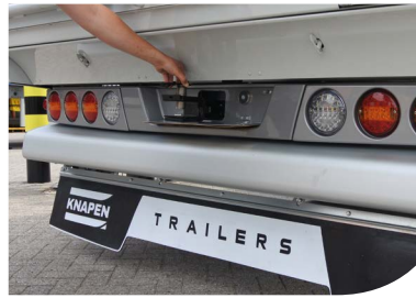
Strong, central towing eye