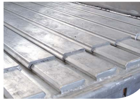
(Semi) Leak proof