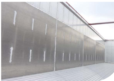
Wear plates in many types and sizes