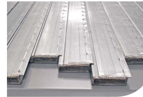
Flat Steel X Floor