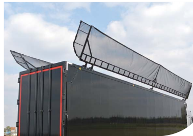
Hydraulic folding roof