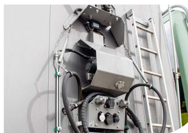
Clean sweep system / Automatic retractable sliding headboard (hydraulic)