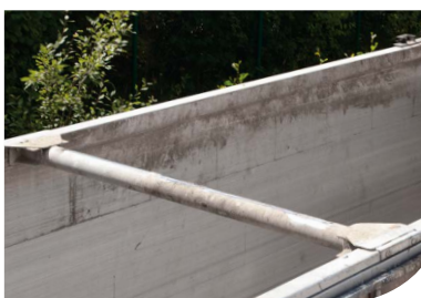
Heavy-duty bar construction